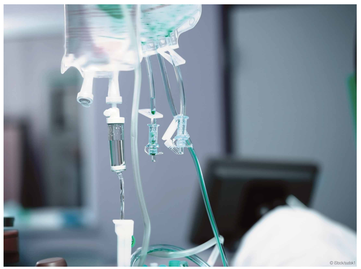
Antibiotics have been widely prescribed to patients affected by Sars-Cov-2/COVID-19 despite many of them not experiencing secondary bacterial infections

COVID-19, 86% of them had undergone antibiotic treatment, despite only 12% of them having had a superimposed bacterial infection.