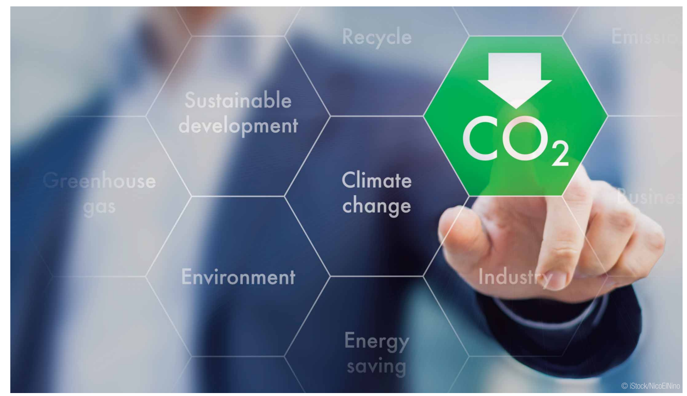
Europe is in fact the most sustainable area in the world. That being said, however, there is still a lot to be done even here

Development Goals (SDGs) that we have developed, aggregating about 100 indicators produced by Eurostat and Istat (the Italian national institute of statistics). These indicators show that we are not yet on the right path, even though Europe is making progress in some areas. Indeed, they have also demonstrated that the situation is actually worsening in some areas, such as with regards to ecosystems.