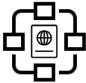
EU Immunisation Information System