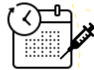
Vaccines Planning and Forecasting