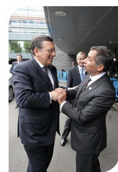
EU Commission President Barroso – EESC President Malosse