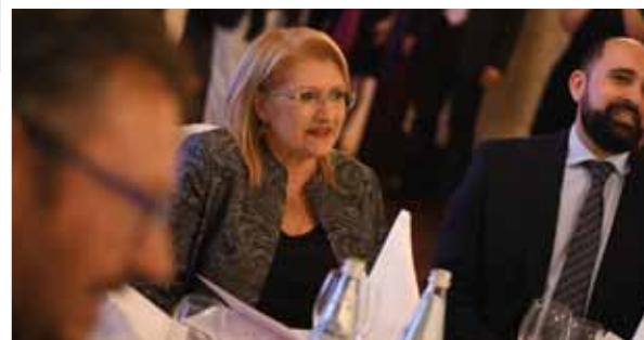
President of Malta H.E. Marie-Luise Coleiro Preca opened the Award ceremony.

Psychologists, Physiotherapists, Occupational Therapists and Biologists handles the project. A total of 646 patients with fibromyalgia and 314 non-fibromyalgia individuals participated in the project.