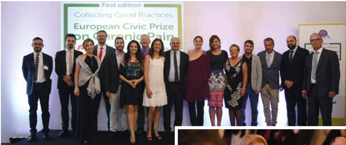
Winners and jury at the "European Civic Prize on Chronic Pain" award ceremony in June in Malta.